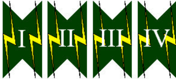
Company B, 51 st CAR